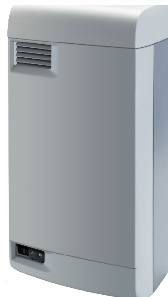
Ducted Steam Humidifier Part# RH2-DUCT

Proper humidification creates an environment where IAQ products can perform at optimum efficiency