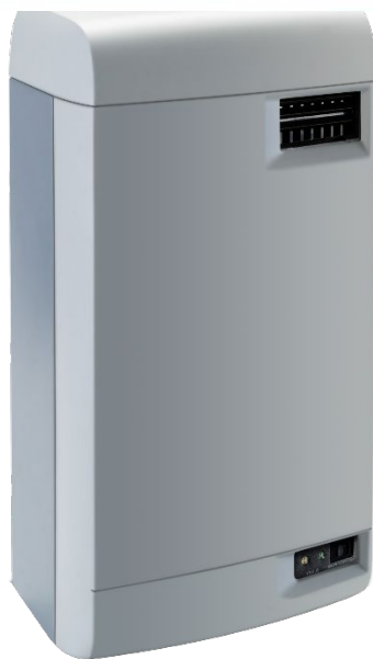
Space Steam Humidifier Part# RH2-SPACE